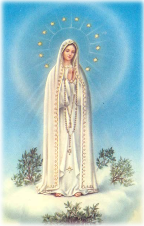
Our Lady of Fatima

We are a group of Catholic women uniquely dedicated to the love and support of God, family and each other; and the promotion and support of the Knights of Columbus and the Ladies Auxiliary.